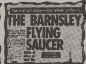
UFOs galore ... Star headlines on alien encounters.

advanced than us. They do not kill people — it they wanted us dead they could do it in seconds.